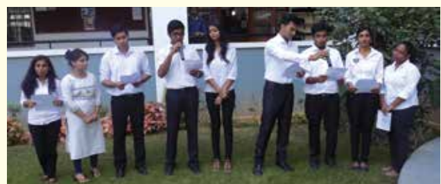
Students' at XIME as part of teachers day celebration