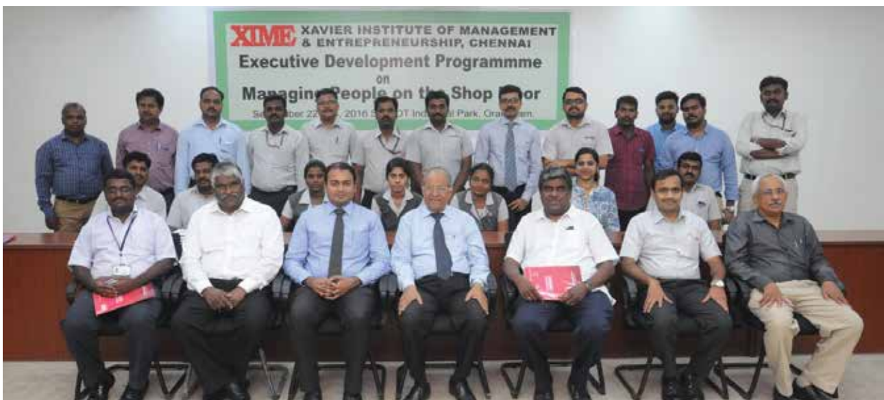
EDP on 'Managing People on the Shop Floor'