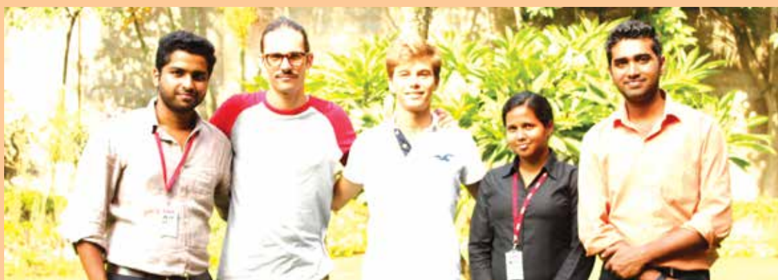
Exchange Program Students with fellow XIMEans

it was a new atmosphere which made them uncomfortable, but later they fell in love with the place. They mentioned that students in the campus are very helpful and kind. They also appreciated the infrastructure and amenities provided in XIME. The curriculum at XIME impressed these students as they mentioned that some of the topics were related to emerging business situations around the world.