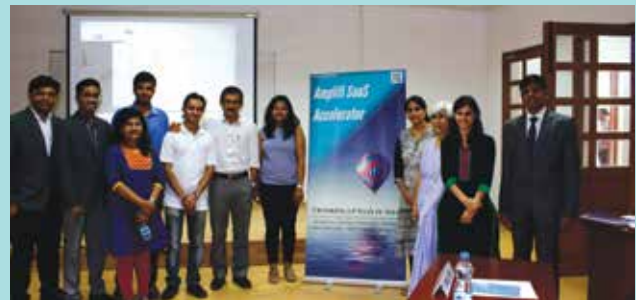
XIME Incubation center team along with Amplifi members