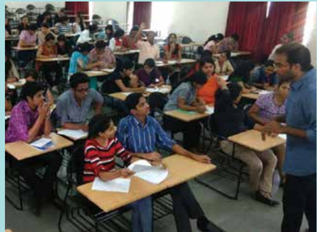
Active Participants of Firesale

Fire sale, the first event of X-Ops (Operations Club of XIME), was conducted on 25TH August, 2016. Twenty five teams of two members each participated in the event making it a roaring success. The competition consisted of two rounds. The first round was a mini intro into supply chain management where participants were given raw materials which they had to procure to create an innovative product. This introduced them to the most common trade off between cost and time, ensuring the participants were quick on their feet. Second round was about the prisoners dilemma, in which contestants had to evaluate the thought process of the other member and see how well they understood each other. The decision making skills of the teams was also tested here