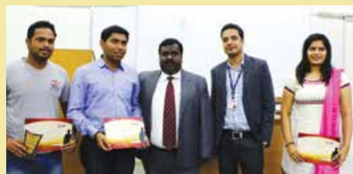
Stock Mind Winners