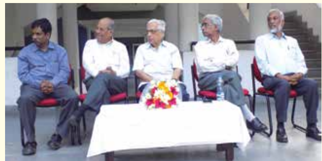
Stallwats at Teachers day Celebration at XIME