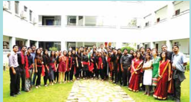
XSEED Club Members